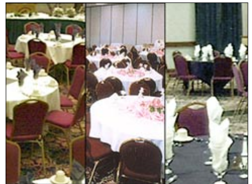
66' x 78' x 14' 5,148 Sq. Ft. Capacity Reception 700, Rounds 400, Banquet 500, Classroom 300, Theatre 600