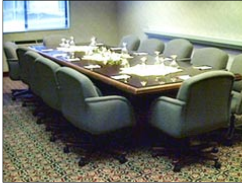
26' x 12' x 7' 300 Sq. Ft. Capacity Reception—Conference 12