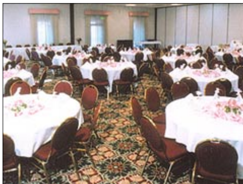
66' x 26' x 14' 1,716 Sq. Ft. Capacity Reception 200, Rounds 120, Banquet 150, Classroom 100, Theatre 200, Conference 66, U-Shape 60