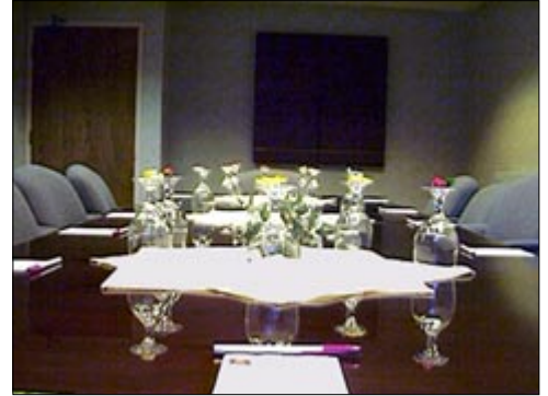
25' x 12' x 7' 200 Sq. Ft. Capacity Reception—Conference 12