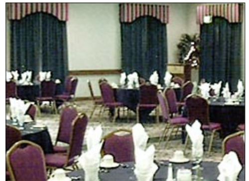
66' x 26' x 14' 1,716 Sq. Ft. Capacity Reception 200, Rounds 120, Banquet 150, Classroom 100, Theatre 200, Conference 66, U-Shape 60