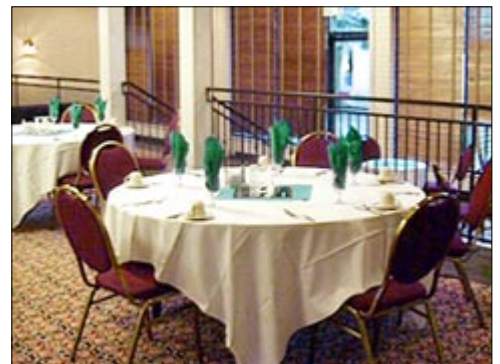
66' x 26' x 14' 1,500 Sq. Ft. Capacity Reception 100, Rounds 100, Banquet 100, Classroom 75, Thea- tre 100, Conference 30