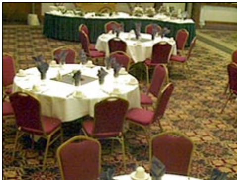
66' x 26' x 14' 1,716 Sq. Ft. Capacity Reception 200, Rounds 120, Banquet 150, Classroom 100, Theatre 200, Conference 66, U-Shape 60